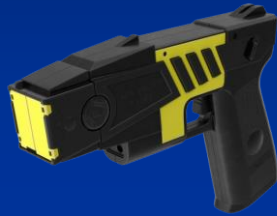
2002 Taser M26 Program