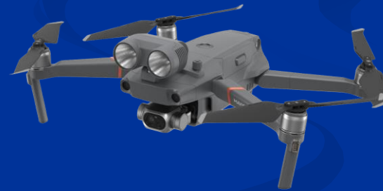
2020 RPAS Program