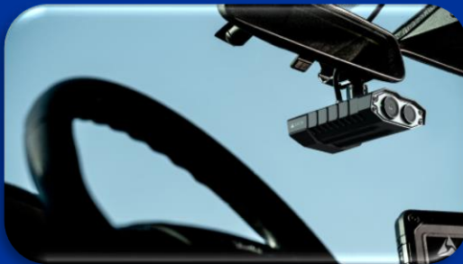
2016 In Car Camera System